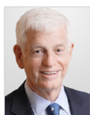
MARIO J. GABELLI, CFA Chief Executive Officer GAMCO Investors, Inc.